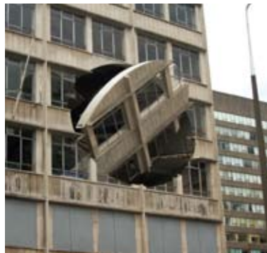
Richard Wilson Turning the Place Over Commissioned by Liverpool Biennial International 06